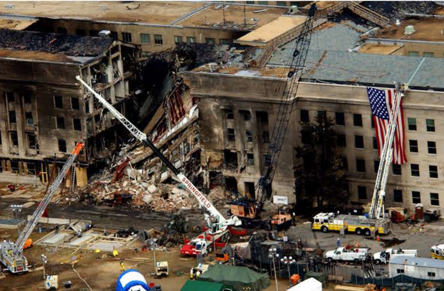
FBI agents, fire fighters, rescue workers and engineers work at the Pentagon crash site.

United Airlines Flight 175 was another flight leaving Boston for Los Angeles and approximately 30 minutes into the flight terrorists had taken over the plane and preceded to New York City and at 09:03 EDT crashed their plane into the South Tower of the World Trade Center.