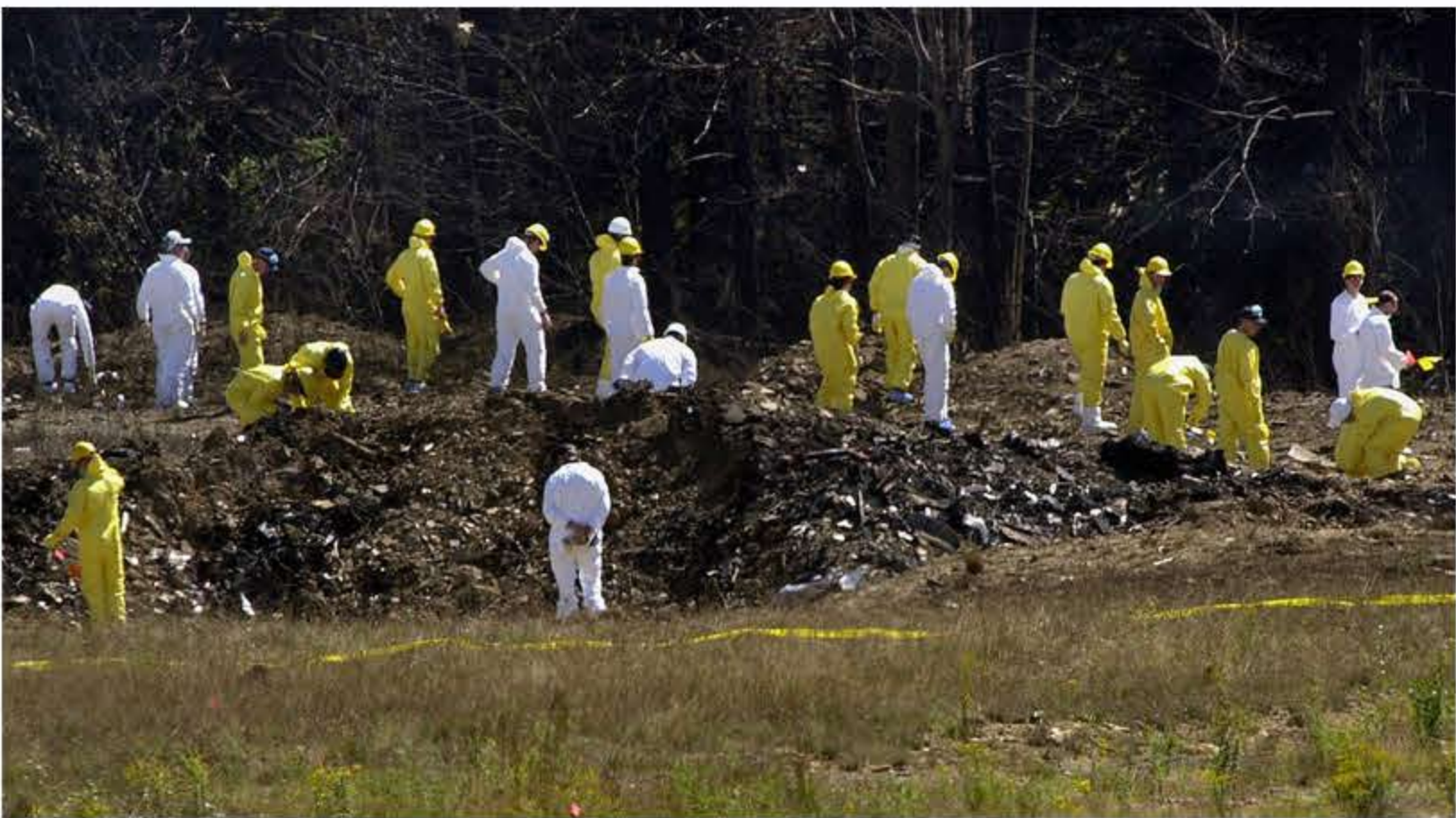
FBI investigators comb the crater left by the crash of United Airlines Flight 93 in Shanksville, Pa.

United Airlines Flight 93 left Newark International Airport in New Jersey for a flight to San Francisco, and 46 minutes into the flight, terrorists took command of the plane turning it east towards Washington D.C. Passengers on this plane had already been receiving messages on their phones of the hijackings and attempted to retake the plane, preventing the terrorists from reaching their target. The terrorists crashed the plane into a field about 65 miles southeast of Pittsburgh.