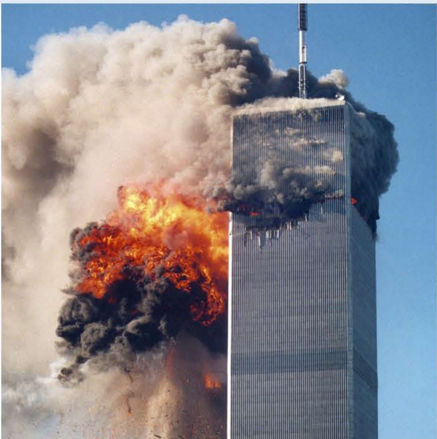
Sept. 11, 2001: Terrorists hijack four U.S. planes, crashing two into the Twin Towers.

FBI agents, fire fighters, rescue workers and engineers work at the Pentagon crash site September 14, 2001, where a hijacked American Airlines flight slammed into the building three days before. The terrorist attack caused extensive damage to the west face of the building and followed similar attacks on the twin towers of the World Trade Center in New York City.