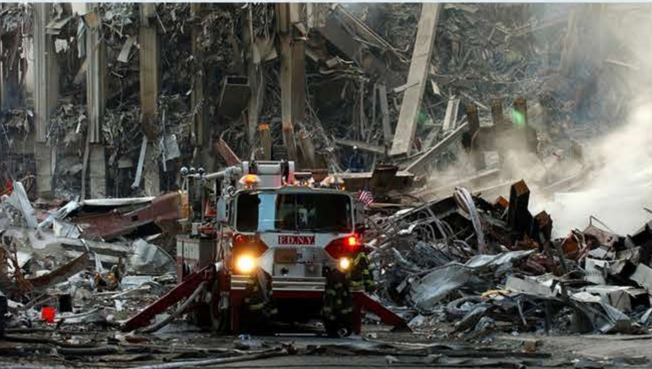
A fire engine at the site of the World Trade Center collapse following the Sept. 11 terrorist attack.

The Federal Bureau of Investigation (FBI), the National Security Agency (NSA), the Central Intelligence Agency (CIA) and other governmental departments and military were now on the hunt as to who and what were behind these attacks.