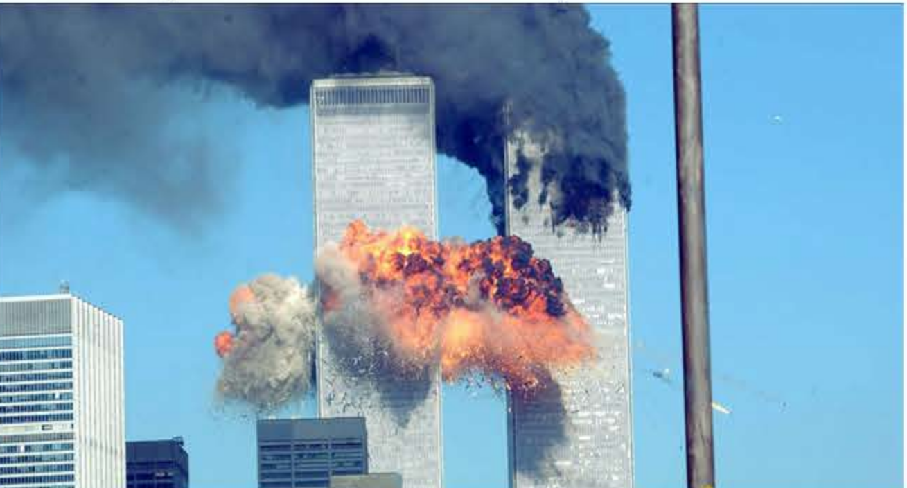
A fiery blasts rocks the World Trade Center after being hit by two planes.