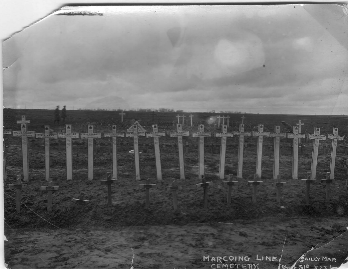
Marcoing Line Cemetery