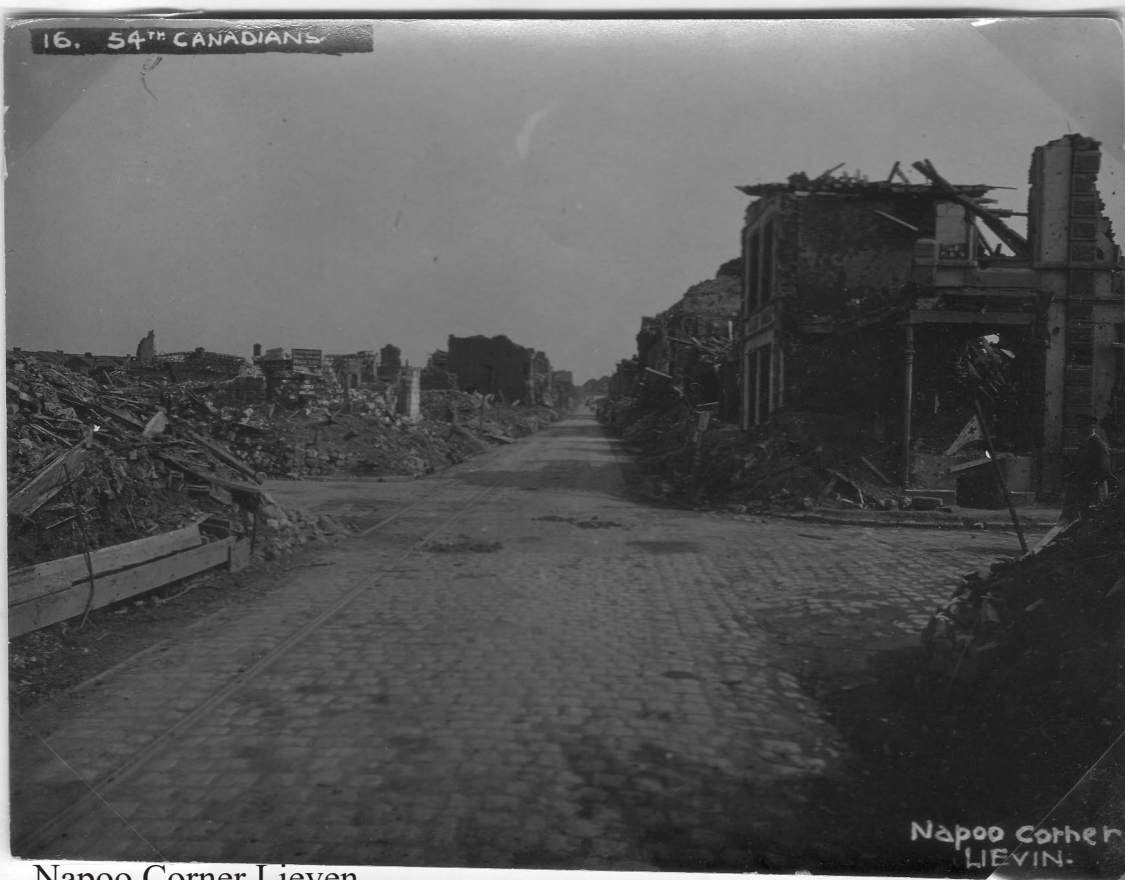
Napoo Corner Lieven