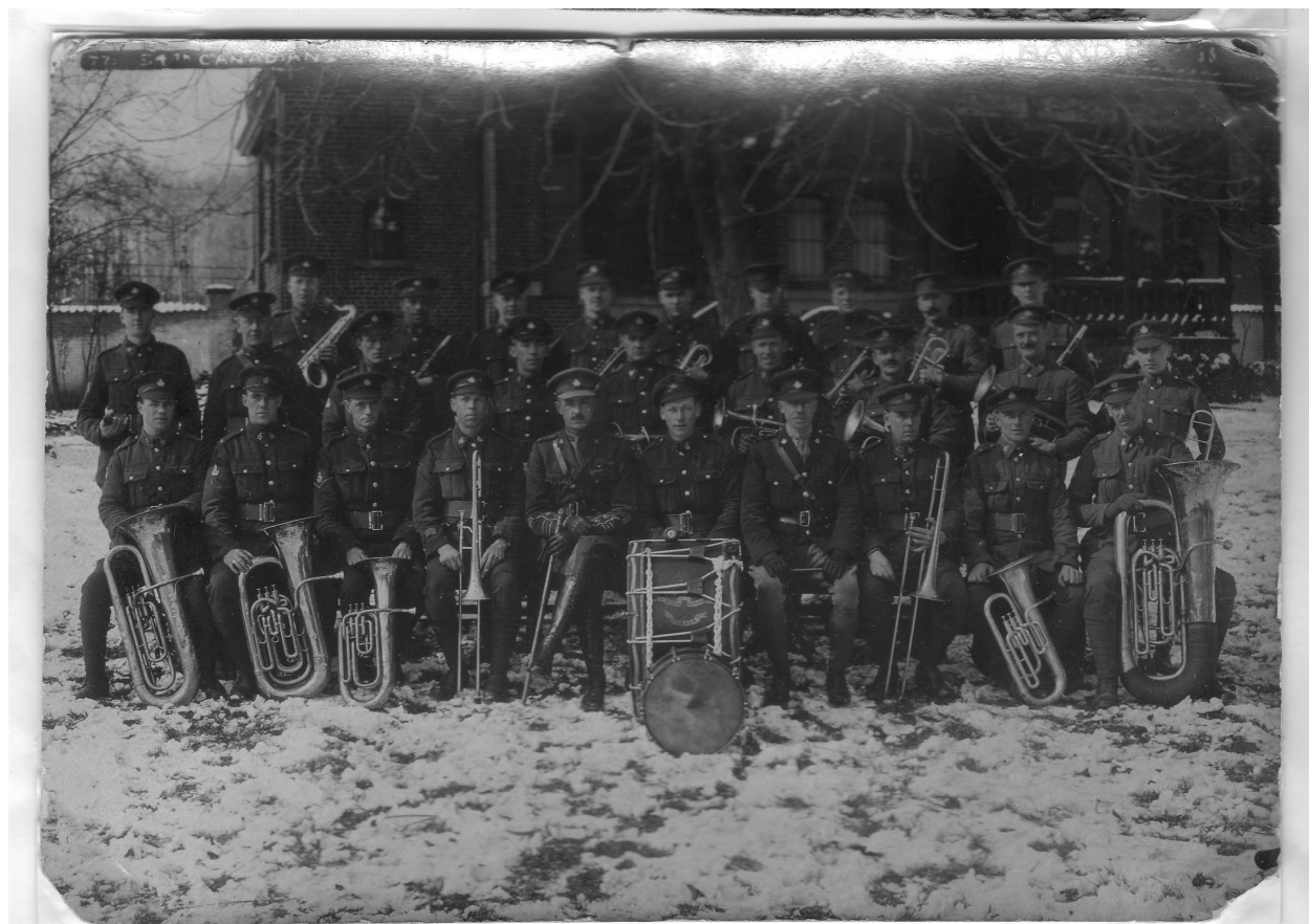
54th Canadians Band