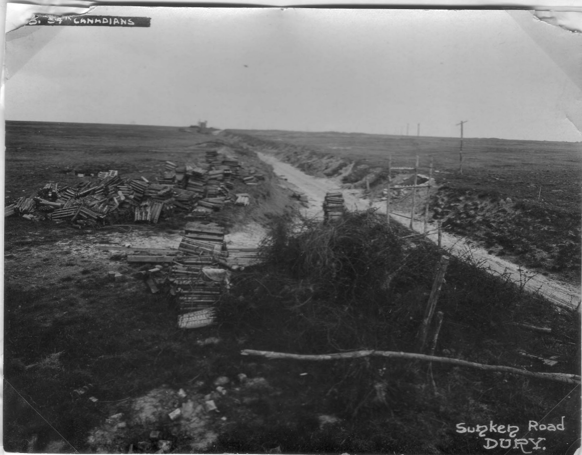
Sunken Road Dury