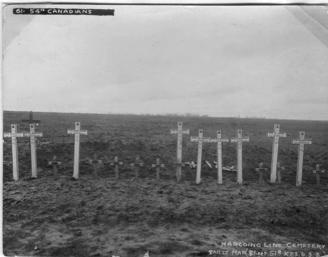
Marcoing Line Cemetery