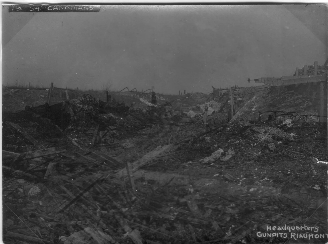
Headquarters, Gunpits Riaumont