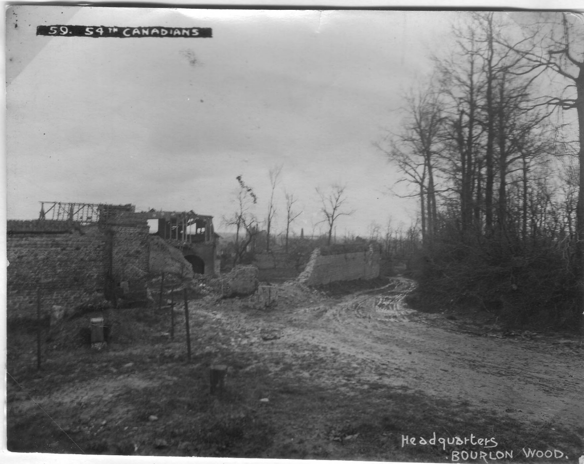
Headquarters Bourslon Wood