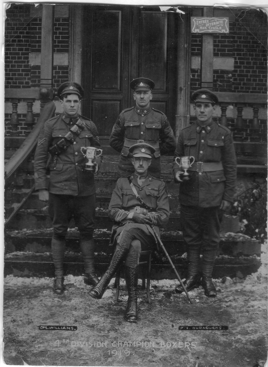
4th Division Champion Boxers, 1919