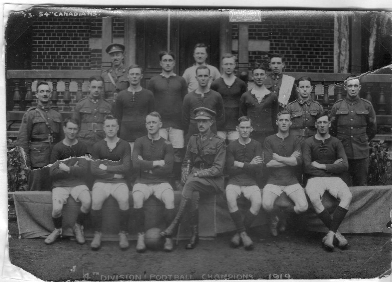
4th Division Football Champions, 1919