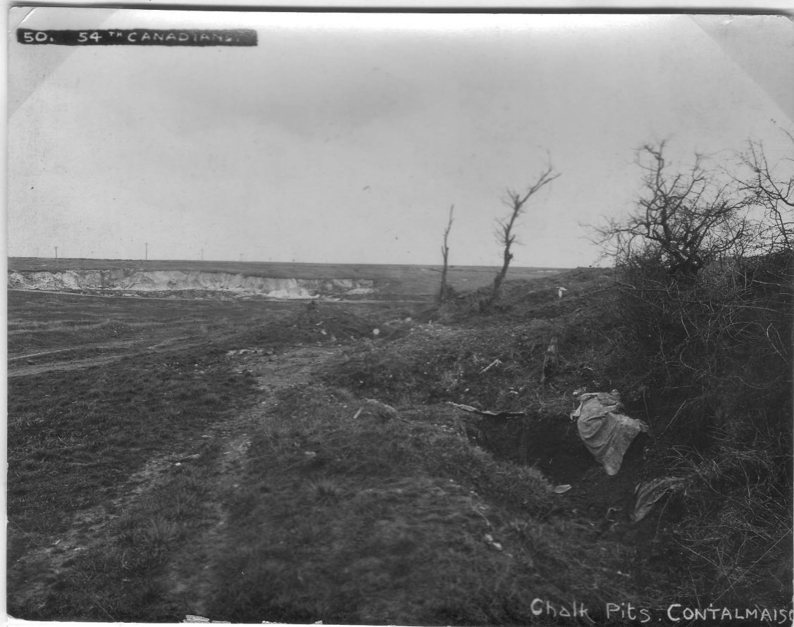
Contal Maison, Chalkpits