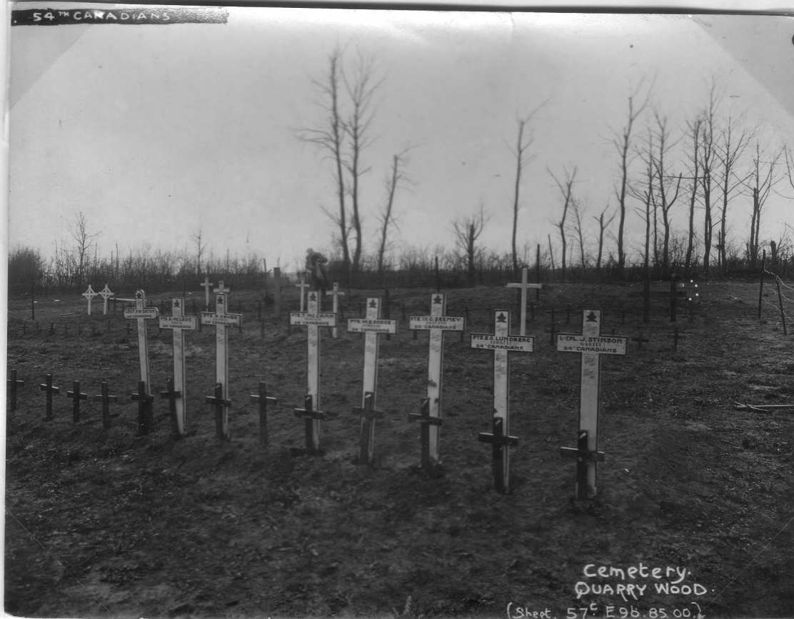
Quarry Wood Cemetery