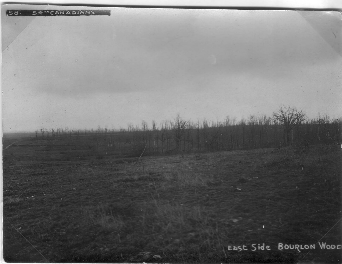
Bourlon Wood, Eastside