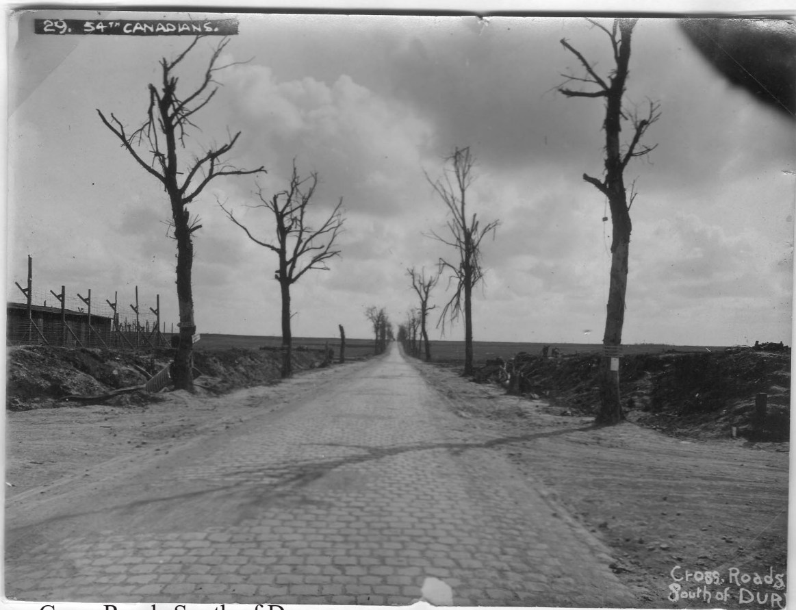
Cross Roads South of Dury