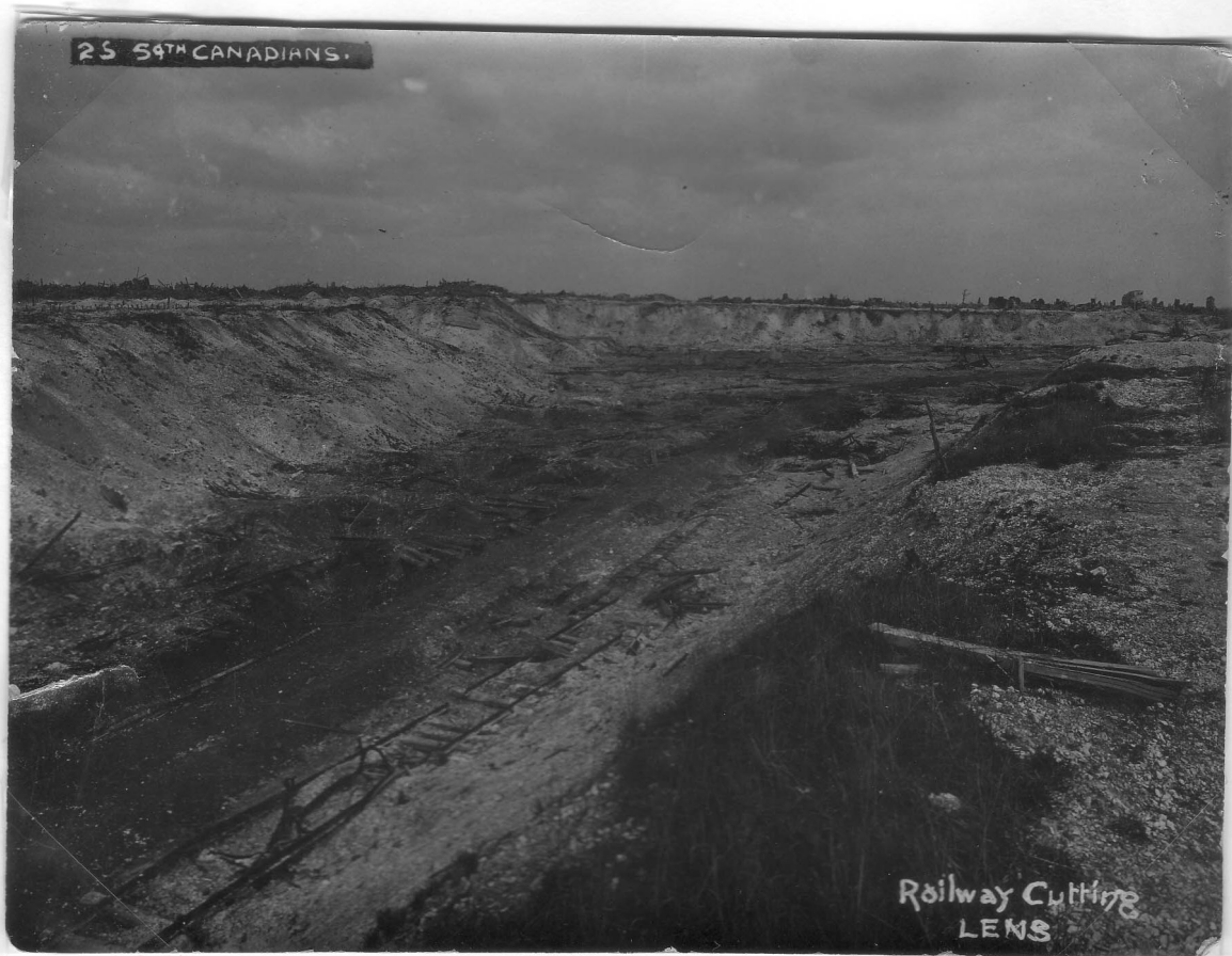
Railway Cuttng, Lens