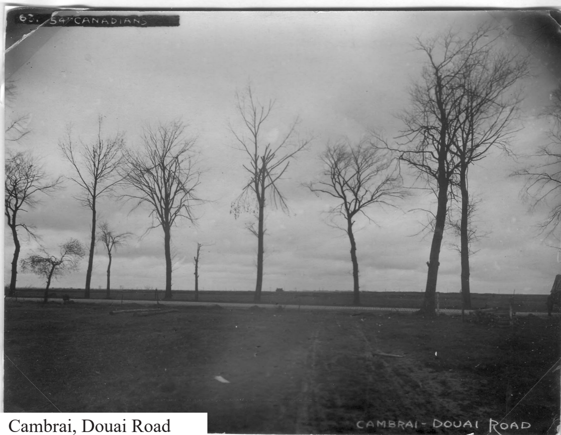
Cambrai, Douai Road