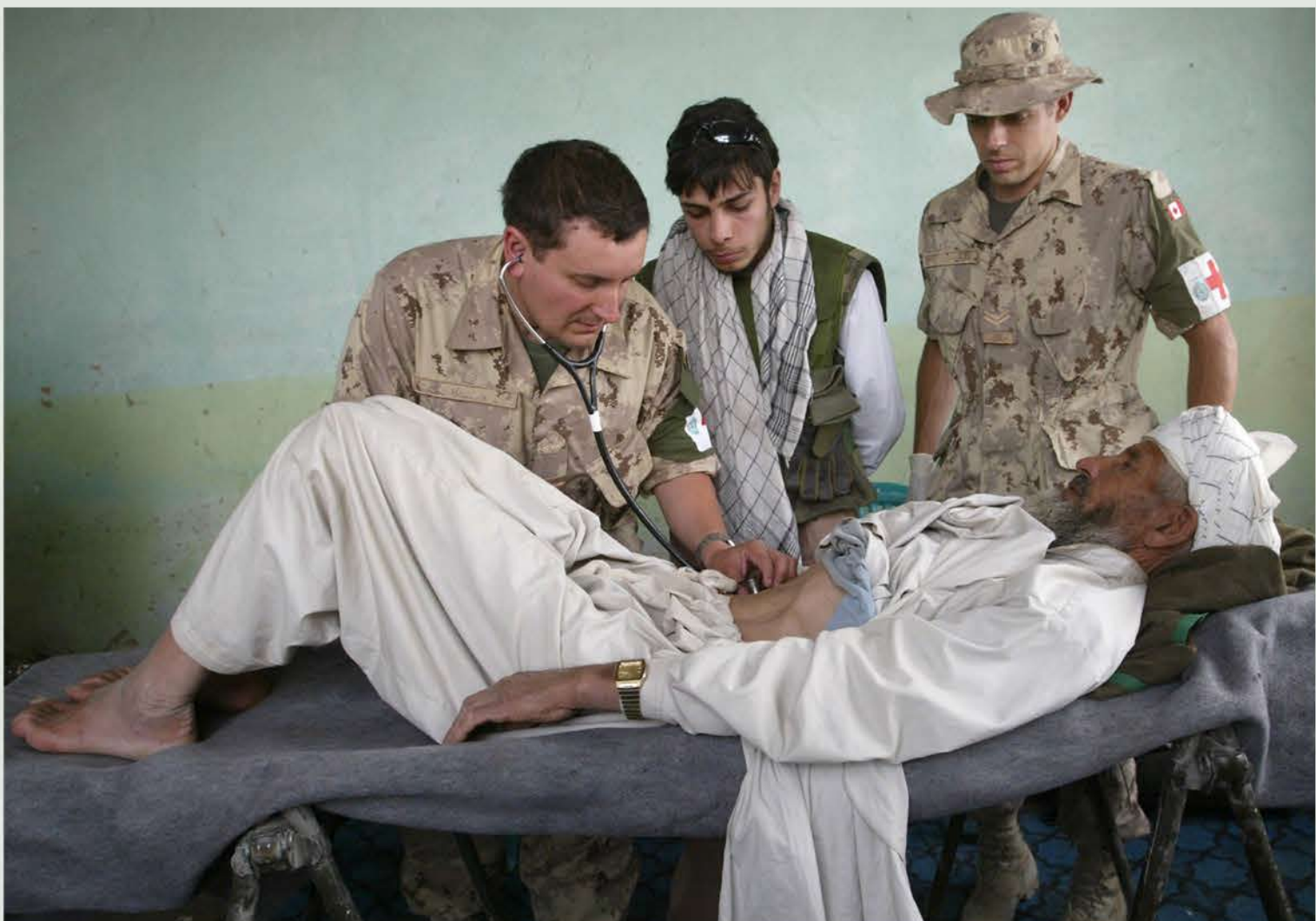
Canada War Museum # 103-03P - CWM - ME - 20080028-001_040622-0805-dax Edits_F72G5293a