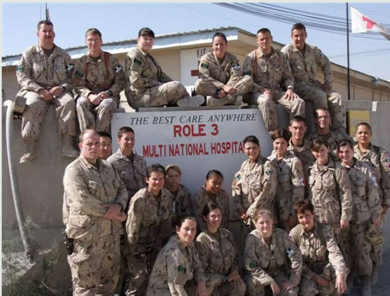
Canadian Element, Role 3 Multinational Medical Unit