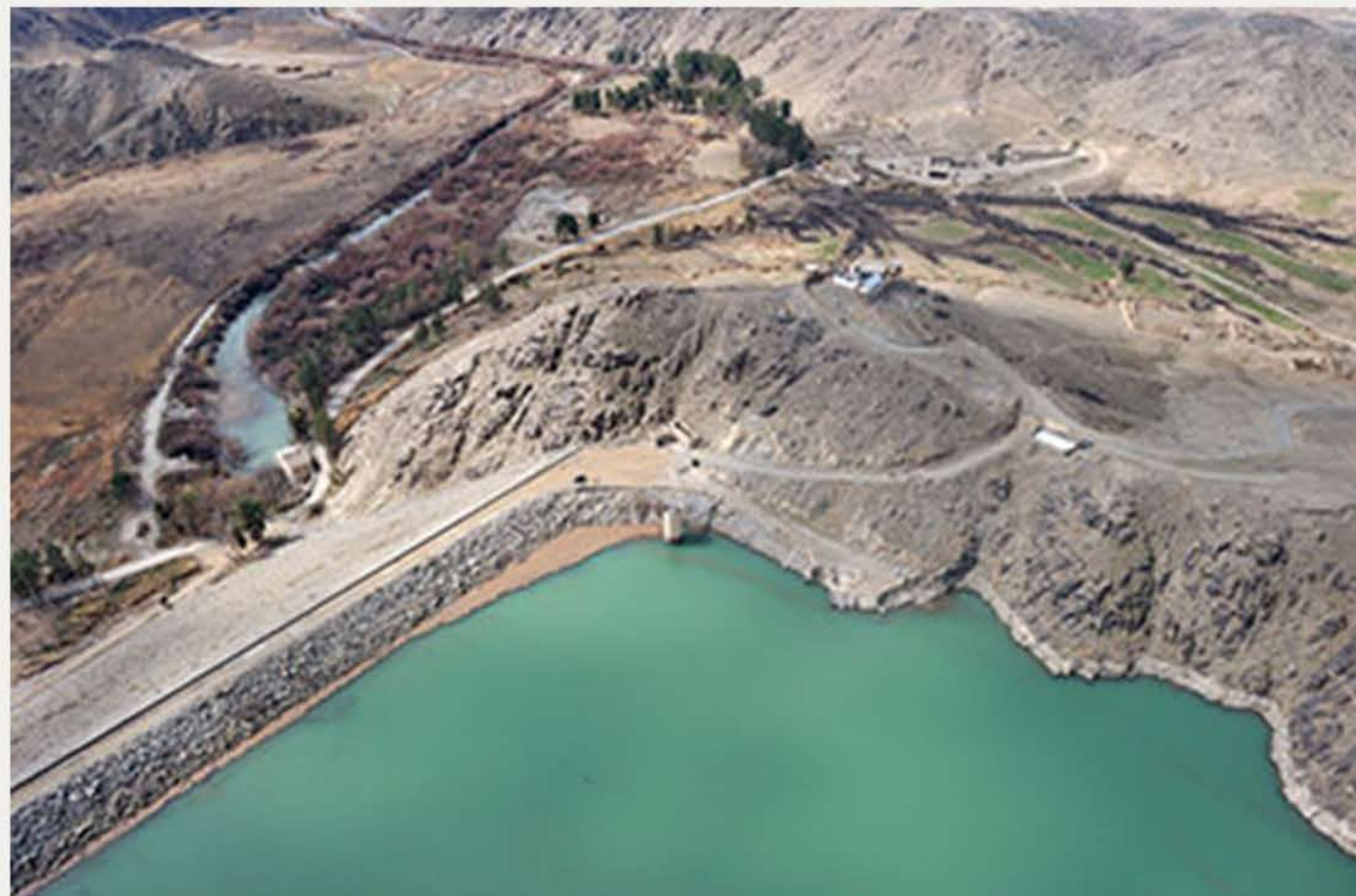
The Dahla Dam and irrigation system