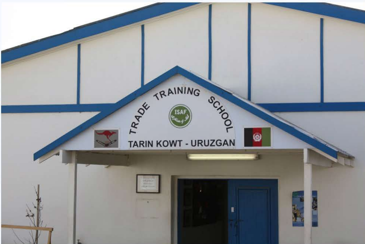
ISAF Trade Training School