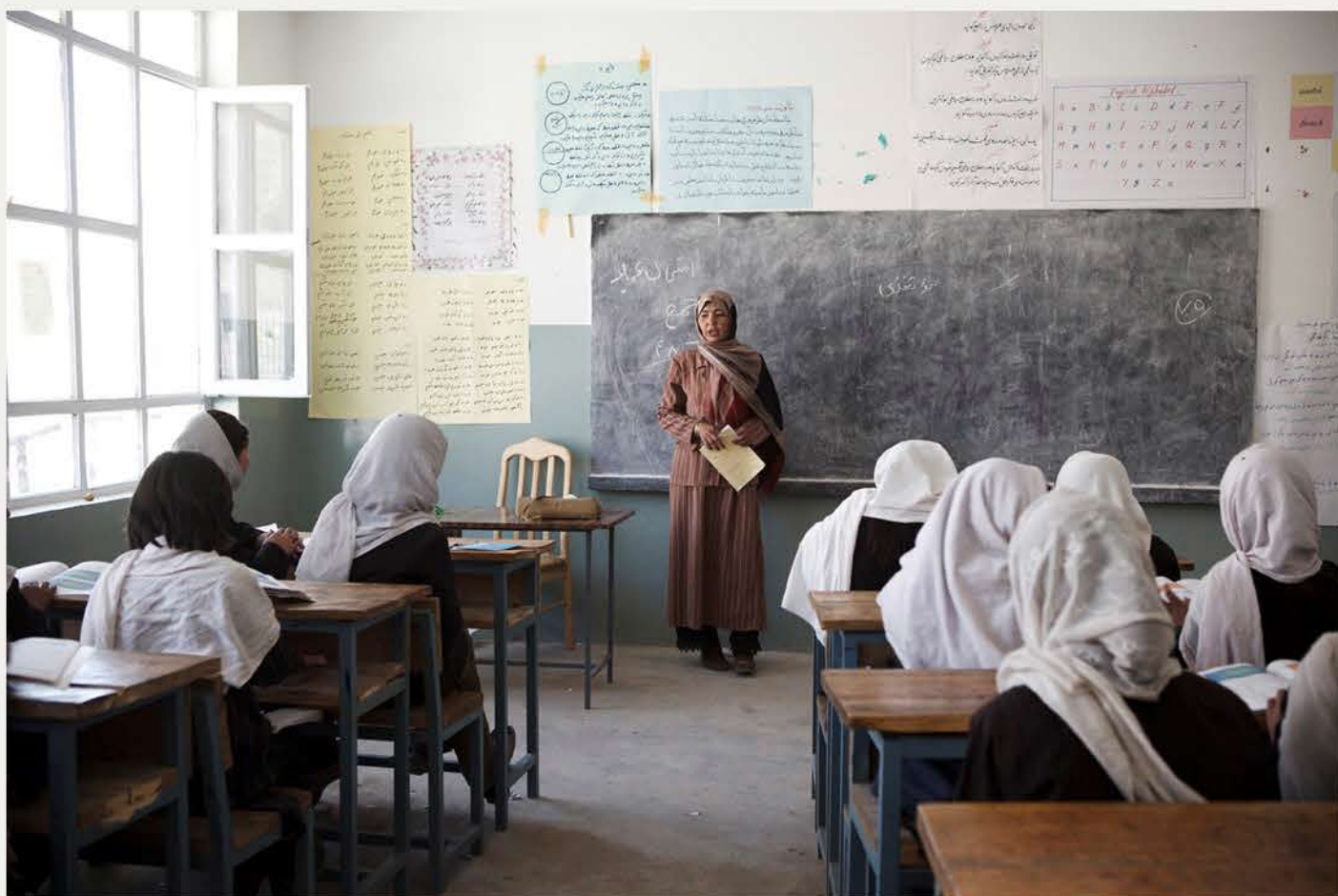
October 12, 2009: Governmental girl school in Afghanistan. With Canada's support teachers have been trained by the Aga Khan Development Network (AKDN).