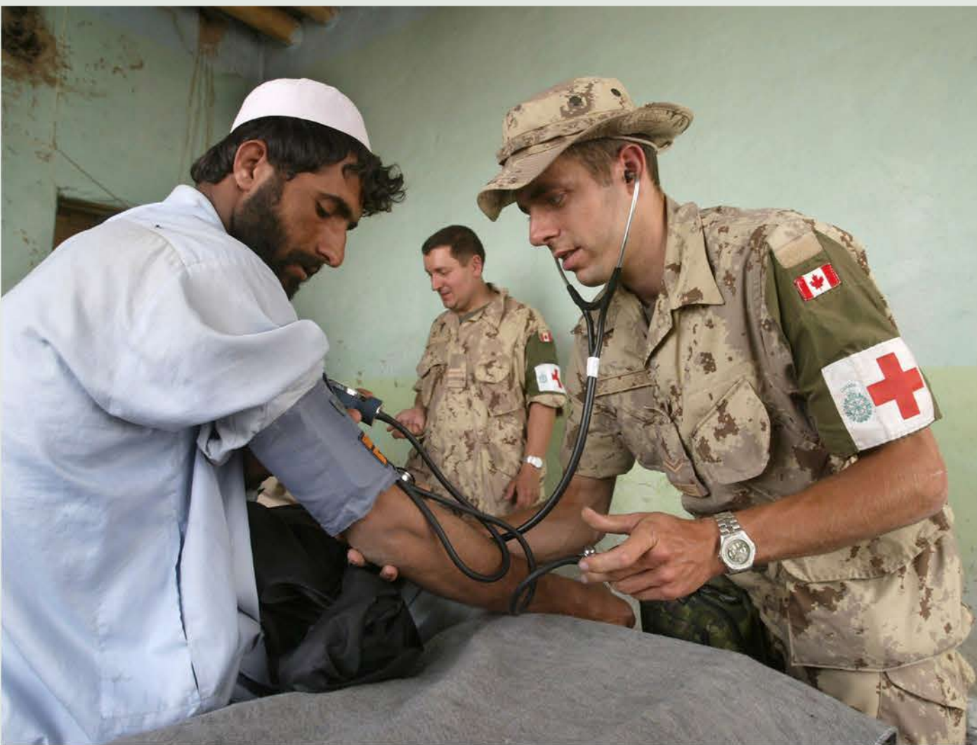
Canada War Museum # 103-03P - CWM - ME - 20080028-001_040622-0805-Dax Edits_F72G526a