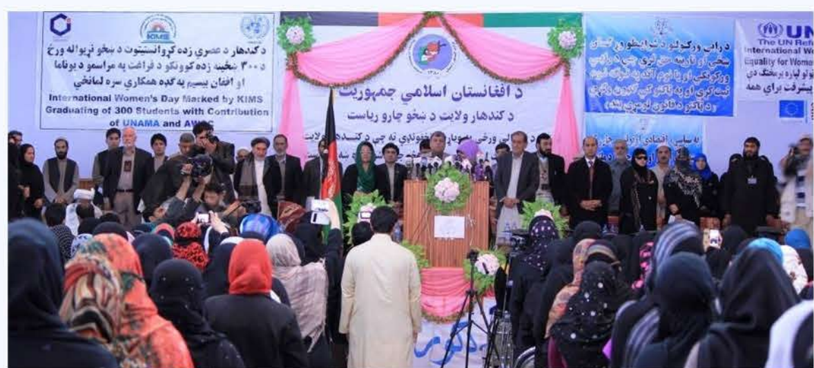
Above: Strengthening the Rule of Law Right: March 10, 2014 International Women's Day Top: Canadian Women Serving in Afghanistan Bottom: Kandahar Institute of Modern Studies

MEDICAL: February 2006: Canadian medical personnel assume command of the Role 3 Multinational Medical Unit, a fully functional field hospital, at Kandahar Airfield. Canadians would remain in command until 2008 and medical personnel continued to serve until December 2011.