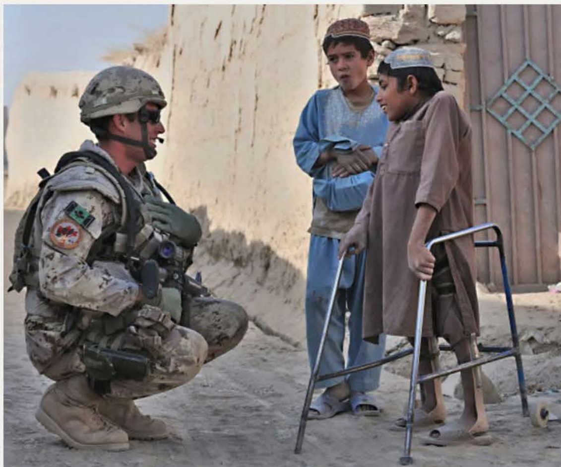
A Canadian soldier on patrol greets an Afghan boy suffering from polio. He now has greater mobility due to a Canadian-led road improvement project.